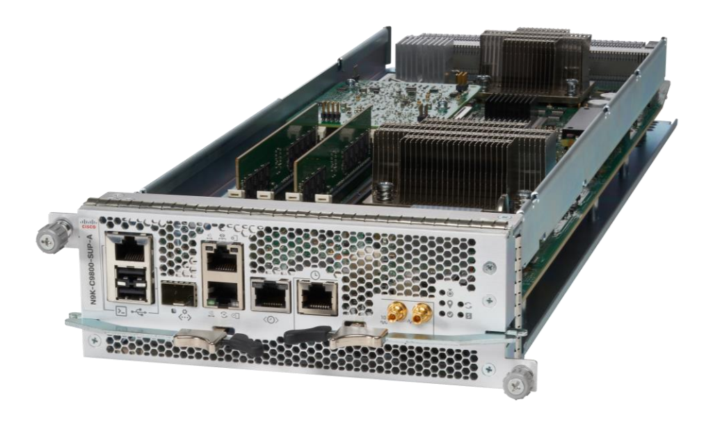
Figure 2. Cisco Nexus 9800 Supervisor (1st Generation)

The Cisco Nexus 9800 Series supports a 36-port 400G QSFP-DD line card. The QSFP-DD ports are also backward compatible with QSFP28 and QSFP+ modules. This line card provides up to 14.4 Tbps capacity with at least seven fabric modules. If the chassis is configured with eight fabric modules, the chassis would provide 7+1 fabric module redundancy to this line card. This line card also supports line rate MACsec encryption on all ports. Furthermore, each 400G port also supports 2x 100G, 4x 100, 4x 25, and 4x 10G breakout options.