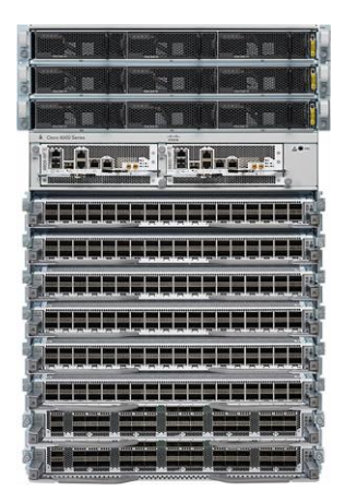
Figure 1. Cisco Nexus 9800 8-slot chassis

The Cisco Nexus 9800 8-slot chassis supports eight line card slots and three power supply trays.