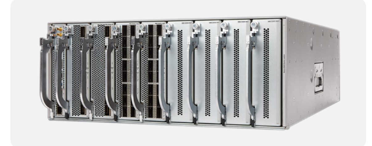
Figure 1. Cisco Nexus 9400 Series Switch front-side

Cisco provides two modes of operation for Cisco Nexus 9000 Series Switches. Organizations can deploy Cisco Application Centric Infrastructure (Cisco ACI) or Cisco NX-OS mode.