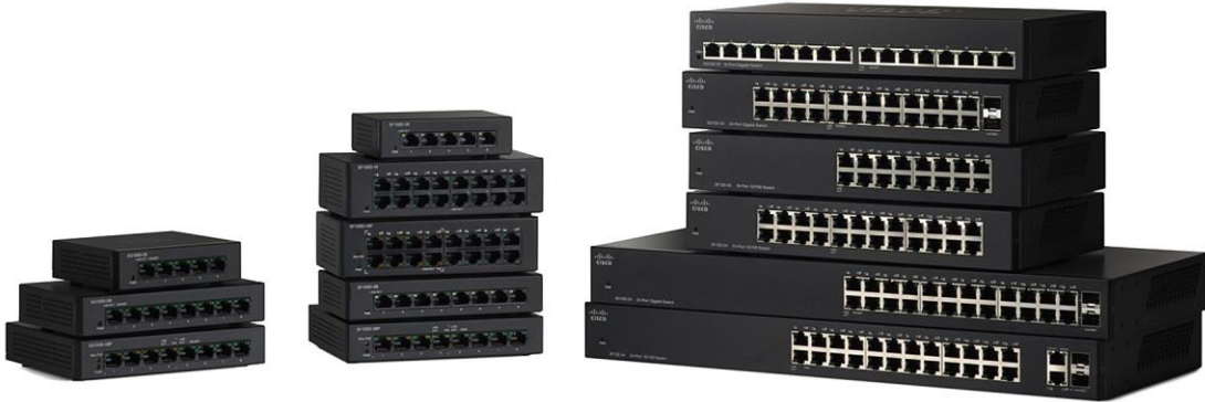
Figure 1. Cisco 110 Series Unmanaged Switches