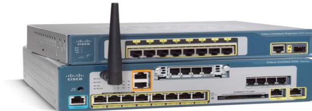
Figure 2. Cisco Unified Communications 500 Series: 24- and 32-User Configuration