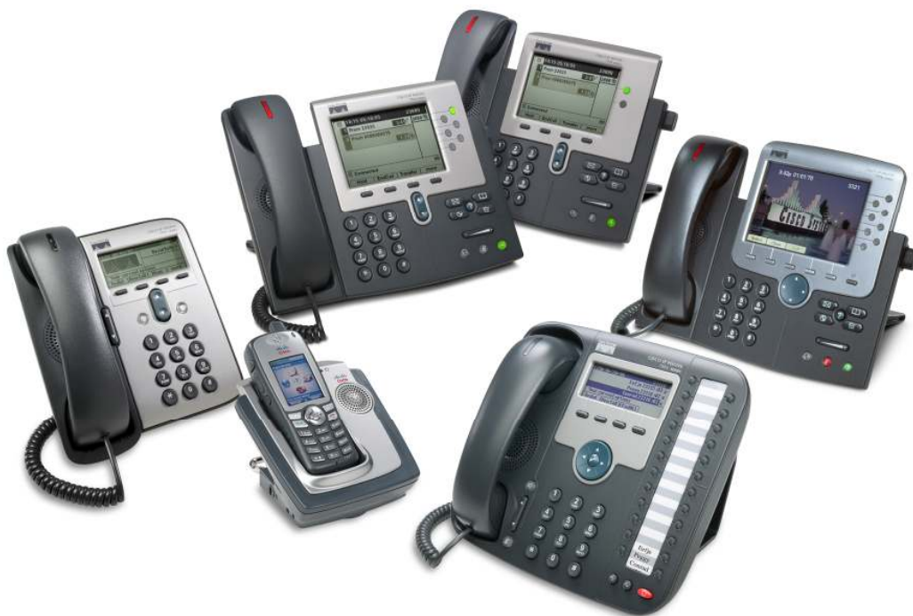
Figure 4. Cisco Unified IP Phone Portfolio

The Cisco Unified IP Phone portfolio includes options for use from wherever you are: the company lobby, the manufacturing floor, the executive suite, at home, on the road, or in a branch office (Figure 4).