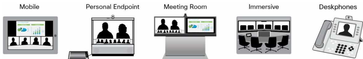
Figure 1. Examples of Cisco TelePresence Server Supported Modes

The Cisco ActivePresence ® capability of Cisco TelePresence Server, a leading patent-pending feature, enables the delivery of next-generation multiparty conferencing, offering a view of all attendees in a meeting while giving prominence to the active speaker. While the active speaker occupies most of the screen, an overlay of others in the call appears in the lower third of the screen, giving participants a natural view of everyone sitting around the virtual table (Figure 1).