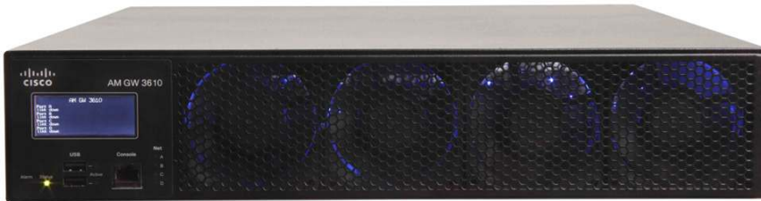
Figure 1. Cisco TelePresence Advanced Media Gateway 3610

The Cisco TelePresence® portfolio creates an immersive, face-to-face experience over the network, empowering you to collaborate with others like never before. Through a powerful combination of technologies and design that allows you and remote participants to feel as if you are all in the same room, the Cisco TelePresence portfolio has the potential to provide great productivity benefits and transform your business. Many organizations are already using it to control costs, make decisions faster, improve customer intimacy, scale scarce resources, and speed products to market.