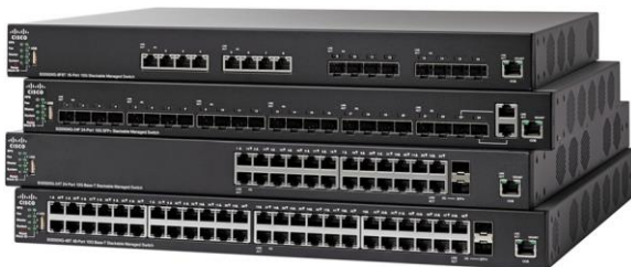
Figure 1. Cisco 550X Series Stackable Managed Switches

Cisco 550X Series switches are designed to protect your technology investment as your business grows. Unlike switches that claim to be stackable but have elements that are administered and troubleshot separately, the Cisco 550X Series provides true stacking capability, allowing you to configure, manage, and troubleshoot multiple physical switches as a single device and more easily expand your network.